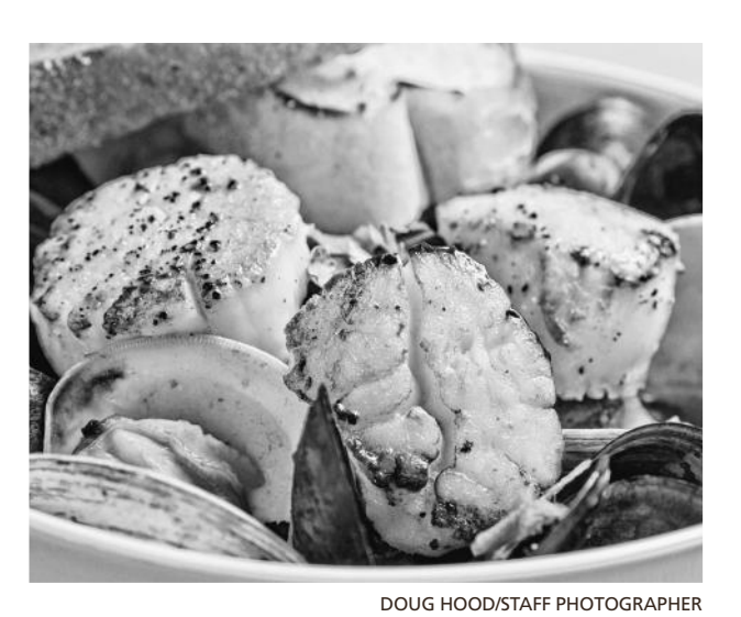
Seafood bouillabaisse: scallops, cod, mussels, clams, fingerling potatoes simmered in a saffron fennel, tomato and lobster broth at Velo Eatery.